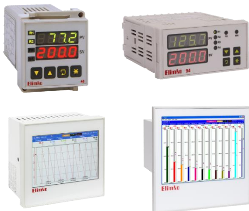
Chart Recorders ,Temperature and process Indicators